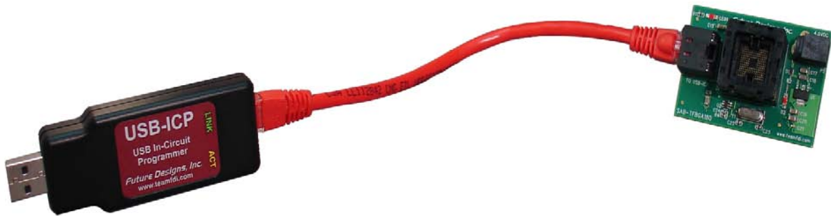
USB-ICP-LPC2K shown with SAB-TFBGA180 (USB-ICP Sold Separately)