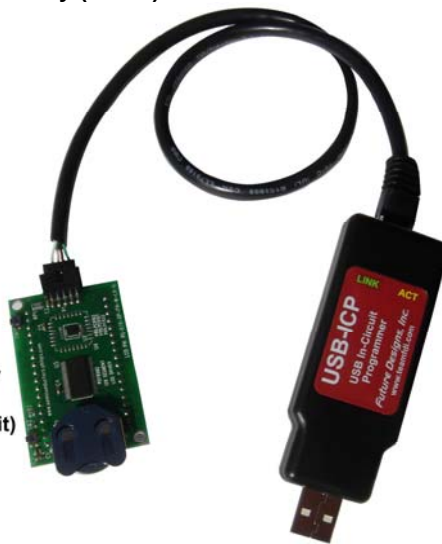
Example User Target Board (Not Part of Kit)

The ISP function uses only six pins: VCC, GND, RXD, TXD, PSEN- and RESET. The simple circuit above is all that must be added to the user’s application to use ISP with USB-ICP.