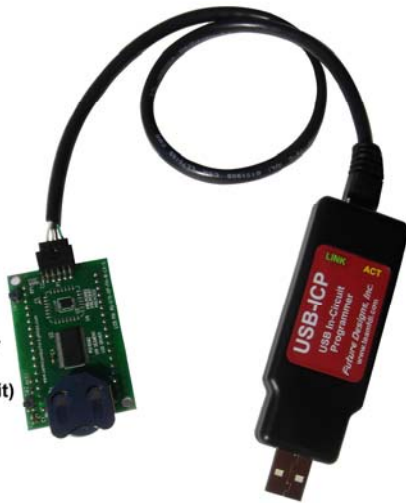
Example User Target Board (Not Part of Kit)

The ISP function uses only six pins: VCC, GND, RXD, TXD, P0.14 (or P2.10) and RESETn. The simple example circuit above is all that must be added to the user’s application to use ISP with USB-ICP. (Consult with your specific device datasheet for details on ISP connectivity)