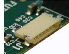
6-pin 1mm Header Mini-ISP