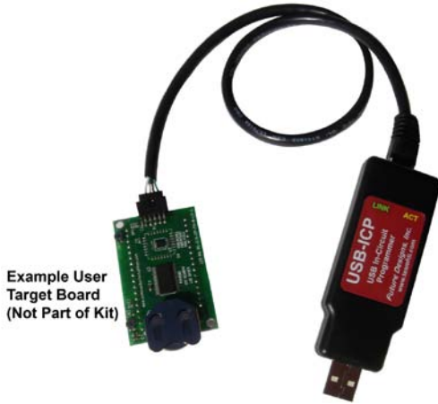
Example User Target Board (Not Part of Kit)