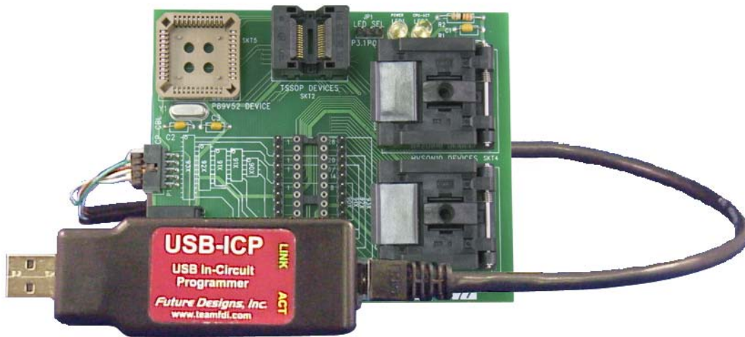
USB-ICP-SAB9 shown with USB-ICP-LPC9xx (USB-ICP-LPC9xx Sold Separately)